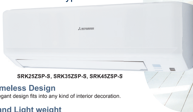
SRK25ZSP-S, SRK35ZSP-S, SRK45ZSP-S